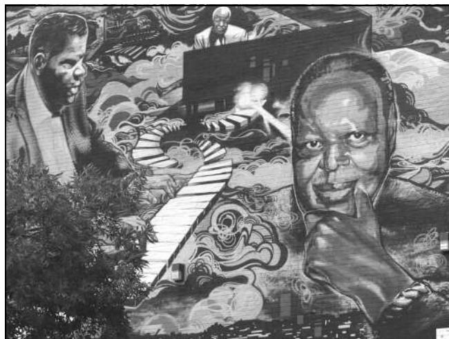
Murals in Little Burgundy, Montreal, pay homage to two of the community's musical sons: Oscar Peterson and Oliver Jones