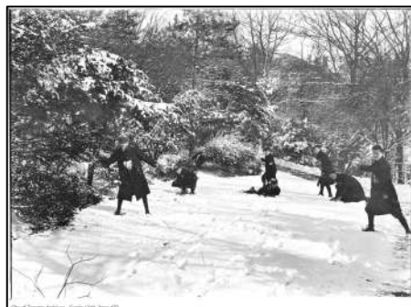
Snowball fight in Rosedale Ravine, 1912.