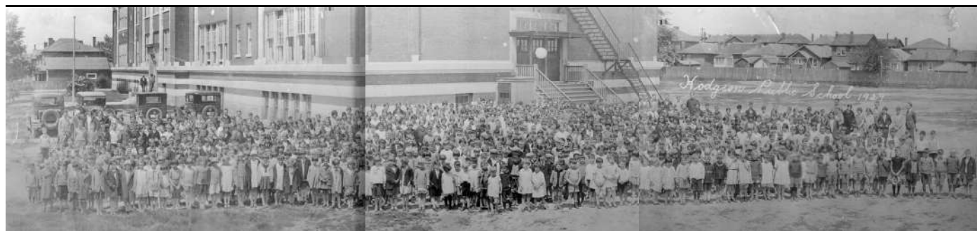
Hodgson Public School, Davisville Ave., 1929